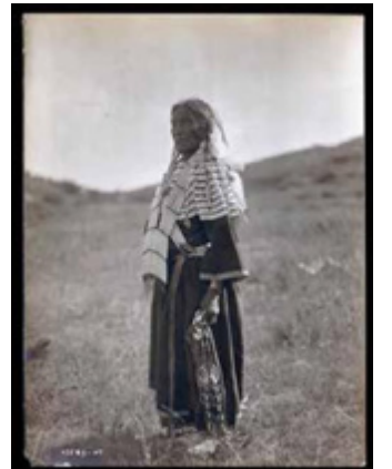
Slow Bull's Wife, photographed by Edward E. Curtis in 1907. Courtesy of the Library of Congress.