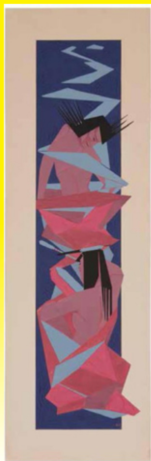
Smoke Signals, by Oscar Howe, ca. 1953.